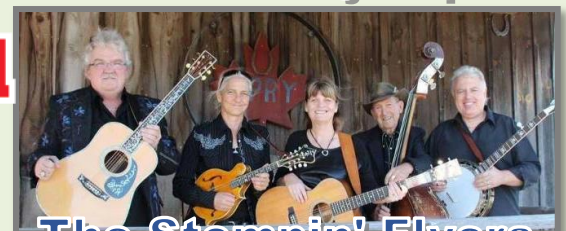
The Stompin' Flyers

Come Out For "Pickin' in the Agricultural Hall" After the Stage Show Friday & Saturday Night... Join us indoors for fun Bluegrass Jammin' & Singin' in the Hen House! Bring an instrument, bring a friend and bring some listeners!