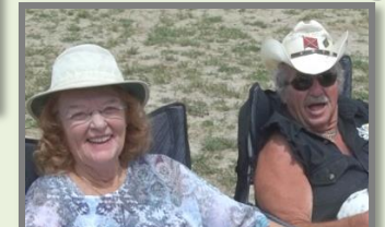
Pete'n Edy Express